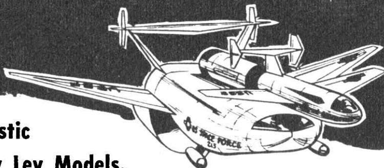
Orbital Rocket $1.49